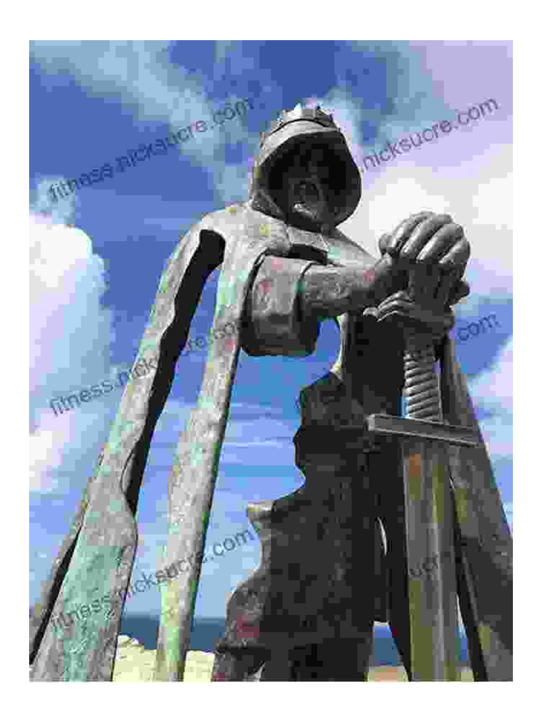
Young King Arthur, Dawn of the Light, Part Two