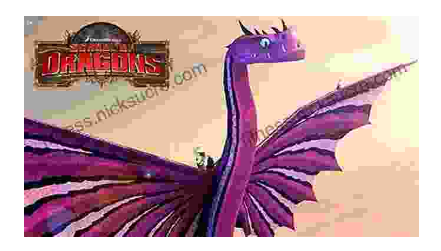
Children soar through the skies on the backs of dragons at Dragon School.